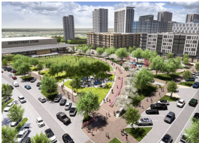
“HIGH-END URBAN DOWNTOWN” AREA COMING SOON

“The development by The Staenberg Group dubbed “Downtown Chesterfield” looks to bring around 2,700 new residential units and millions more square feet for office, retail, grocery, restaurant or other uses on the 117-acre site”.