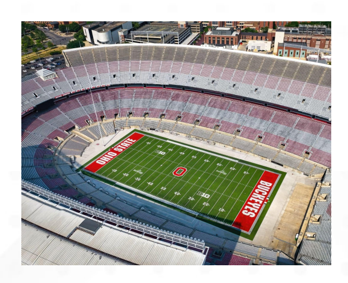
OHIO STATE UNIVERSITY