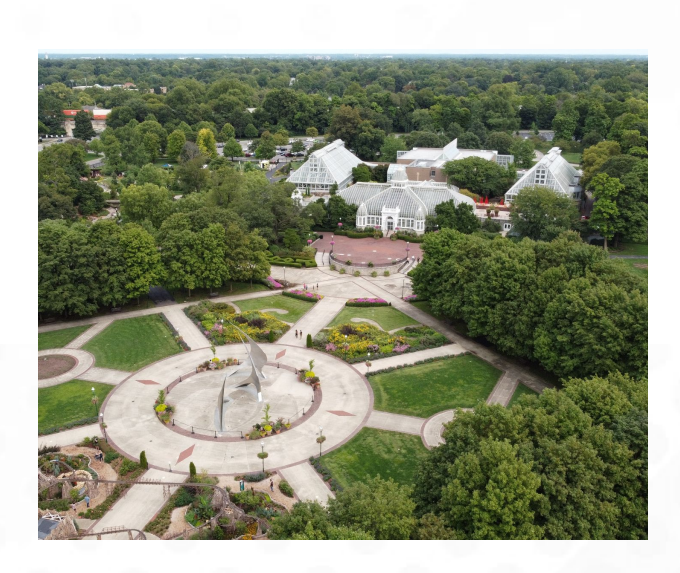
FRANKLIN PARK CONSERVATORY