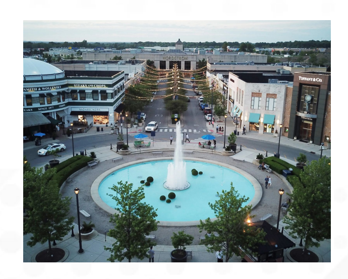
EASTON TOWN CENTER