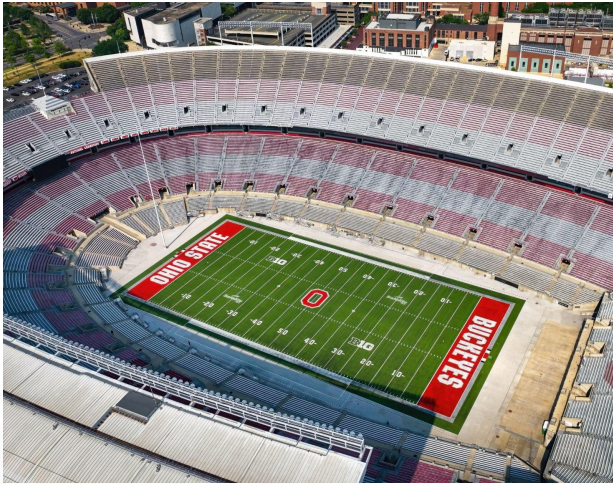
OHIO STATE UNIVERSITY