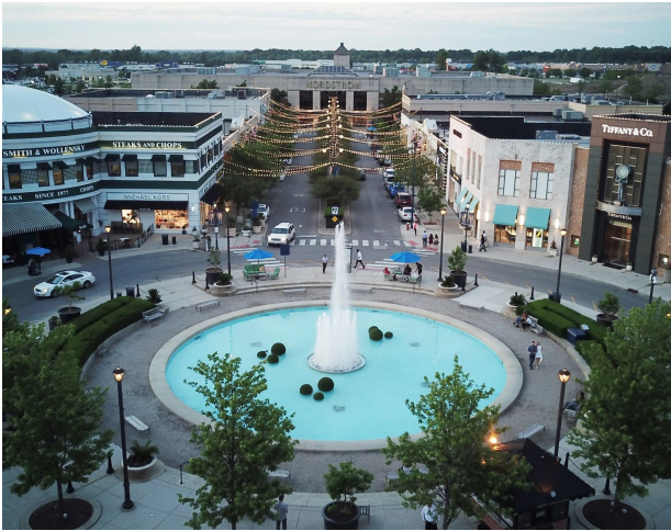
EASTON TOWN CENTER