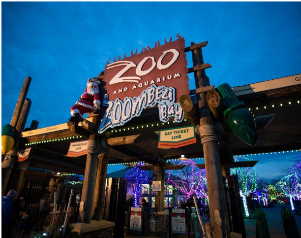
COLUMBUS ZOO AND AQUARIUM