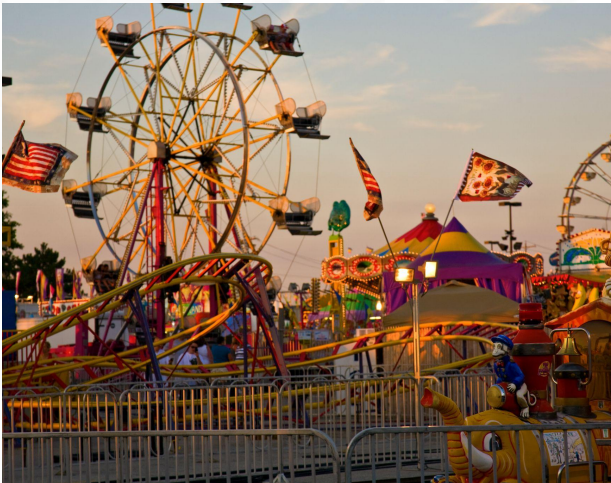
OHIO STATE FAIR