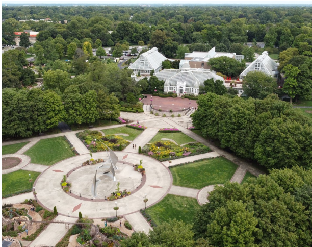
FRANKLIN PARK CONSERVATORY