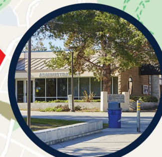
TRABUCO HILLS HIGH SCHOOL