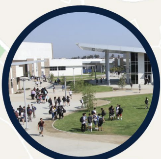
PORTOLA HIGH SCHOOL