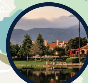
RANCHO SANTA MARGARITA CITY